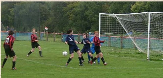
Sawbridgeworth Town 1 Tottenham Hotspur 0