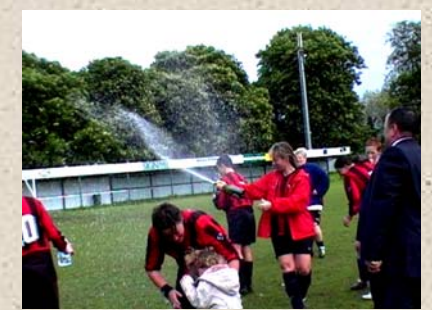
Sawbridgeworth Town 1 Peterborough 2